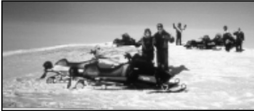
Snowmobiling through the Badlands

The residents and tourists of Assiniboia and District enjoy a continental climate with flourishing springs; warm dreamy summers; active, colourful falls and above seasonal winters thanks to the warm winds of the Chinooks or snow-eaters which are exclusive to the southwest of the province. Winter temperatures range from + 5°C to -30°C (40°F to -35°F). Ample snowfalls encourage winter activities and sport enthusiasts such as snowmobilers and cross country skiers.