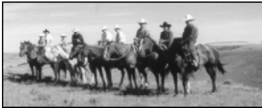
The professional cowboys of Medicine Lodge Outfitters invite you to take "Guided spur of the moment rides through Grasslands National Park."