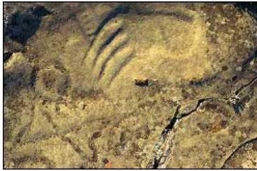
St. Victor Petroglyphs